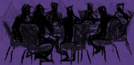
TABLE TALK w/ Geoff Bond